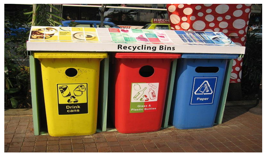
Figure 4: Trashbot automatically separates recyclables from garbage

Such issues led to the launch of Pittsburgh on a clean robotic basis to improve Trashbot. Trashbot is embedded with the robot trash can system empowered by AI. When someone throws an object into a tank, the computer detects the type of object using the power of sensors and machine learning. It can be re-measured with 90% accuracy, any fluid can be extracted and placed in the right tank. The trash boat is ideal for large and dense areas that produce a lot of waste, such as shopping malls, stadiums and airports. In the future, Clean Robotics plans to install LEDs in the system to let the user know if the discarded item has been recycled.