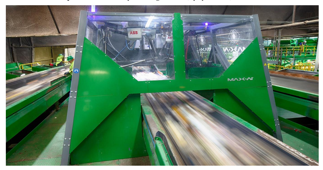
Figure 5: Bulk Handling Systems Max-AI units are among a growing number of technologies

Many advanced filtering devices have multiple sensors and cameras and the data collected from the devices can be analyzed to maximize line performance. Automated editors can identify specific objects and see how they fit into the system. They compared new and historical data and data from different parts of the machine. Some providers report adding anonymous user data to their database for further analysis and allowing users to learn how their streams compare with industry-leading trends (Pyzyk, 2019).