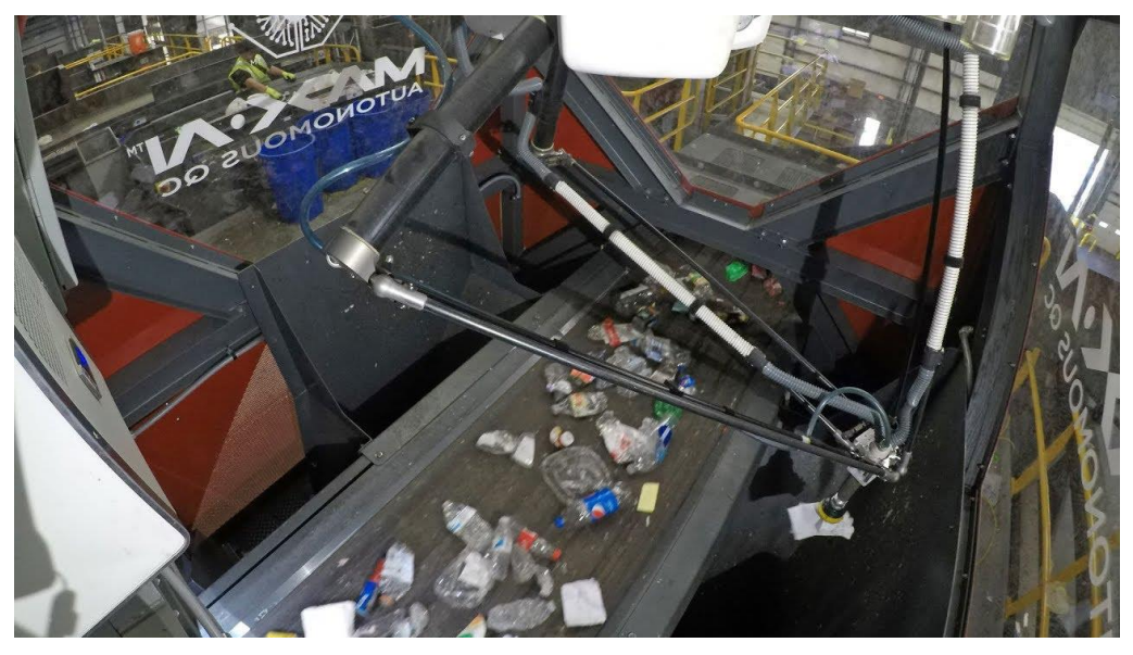
Figure 1: Robot uses AI to Sort Recyclables

Then came Spain. Sadako Technologies is working on AI-based waste disposal projects at a lower rate than General Robotics. The company also uses related policies to connect to a multi-layer network that lives in the cloud.