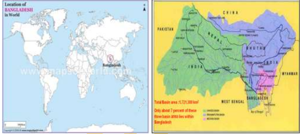
Figure 1: Geographical Location of Bangladesh Figure 2: The GBM River Basin (http://www.mapsofworld.com/bangladesh; JRC, Bangladesh- www.jrcb.gov.bd)

Located in an alluvial deltaic floodplain, Bangladesh faces massive water resources challenges in terms of (i) severe flooding, sedimentation of river channels, and erosion of the riverbanks causing severe social hardships; (ii) scarcity of water during the dry season amidst expanding water demand; (iii) saline intrusion and environmental degradation in particular in the Southwest; (iv) cyclones and tidal surges in coastal areas; and (v) heavy arsenic contamination of groundwater. With dense population, water management is further complicated by diverse and conflicting interests among traditional livelihood activities including agriculture, fisheries, transportation, industries, and water supply, with which poverty is deeply intertwined. Water is also essential for the country's rich and vulnerable natural ecosystems. The Global Climate Change and Upstream withdrawal of water are going to create future challenge in Water Resources Management in Bangladesh. Therefore, it is of paramount importance for the country to manage this critical resource in an integrated and strategic manner while ensuring stakeholder participation.