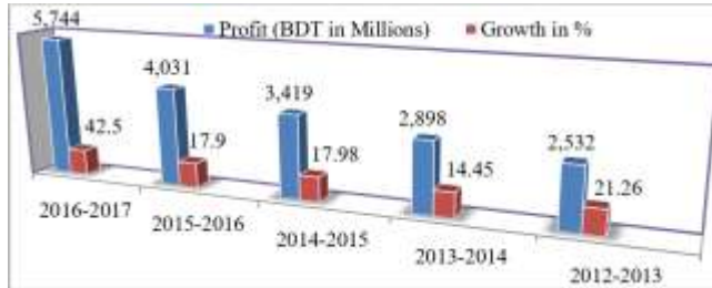
Figure 3: Graphical Presentations of Historic Net Profit (AT) and Its Growth

figure no 2. The highest growth of 25.17% is seen in the current year with the turnover of BDT 30,282 millions and that growth is 8% more than the initial period of the study that is 2013-2014. This figure also indicating the amount of turnover of current is almost BDT 10,000 millions more than the initial period of the study.